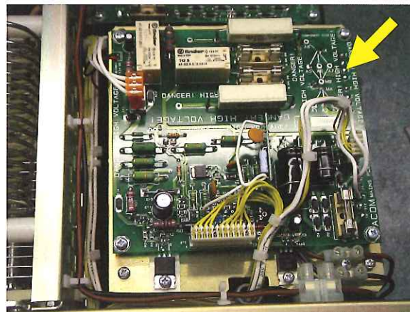
Fig.4 Mains PCB and voltage-selection jumpers location

The MAINS PCB is located in the right-hand compartment of the amplifier, just above the HV transformer - see Fig.4.