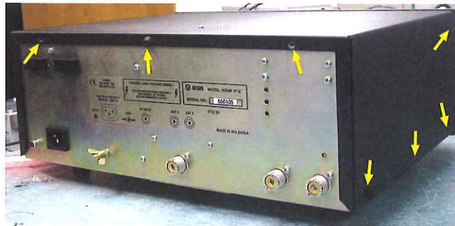
Fig.1 Cover Screws

Using a Philips-2 screwdriver, unscrew 11 pcs of flange-button head screws - three on the rear edge and 2x4 pcs on both sides - fig.1: