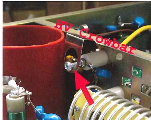
Fig.3 High Voltage Crowbar

b) Check whether the High Voltage Crowbar (located on the middle chassis wall) does reliably short-circuit its center screw to the chassis when the top cover is removed. It must keep the HV circuit connected to the chassis ground during all your operations - fig.3: