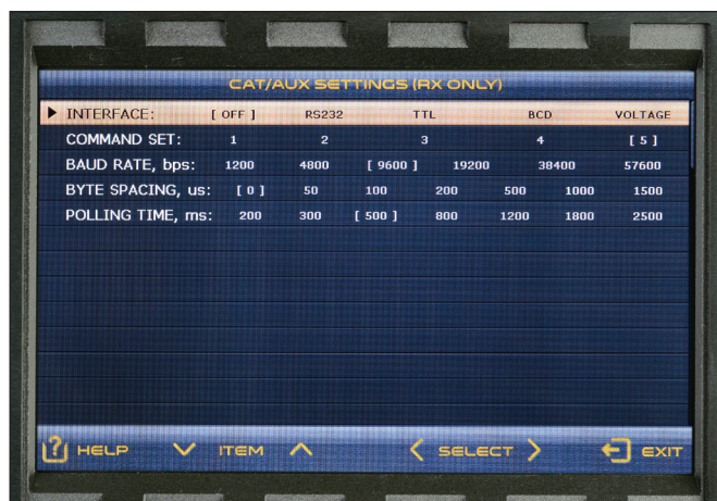
Figure 2 — The CAT/AUX screen is used to set up the transceiver interface so the amplifier will follow the transceiver's band changes automatically.

The 600S incorporates a sophisticated automatic system to protect the amplifier from malfunction or operator error. The control