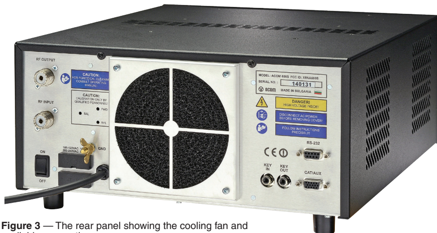
Figure 3 — The rear panel showing the cooling fan and available connections.

Integrating the ACOM 600S into my station was simple. The rear panel (Figure 3) has SO-239 jacks for the transceiver and antenna, and a phono jack for TR switching (KEY IN), nine-pin S-sub connector for RS-232 and 15-pin D-sub connector