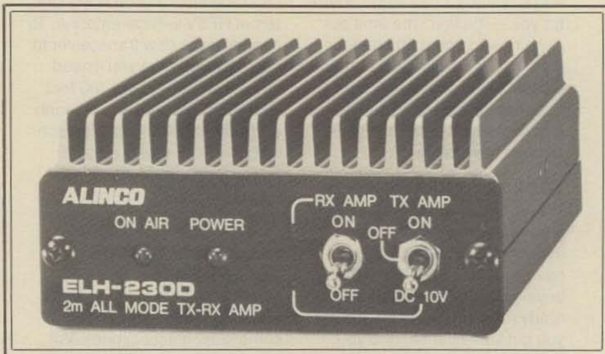
The Alinco ELH230D 2 meter amplifier, an elaborate unit with some exciting features.

Eastwood Village No. 1201 So., Rt. 11, Box 499, Birmingham, AL 35210