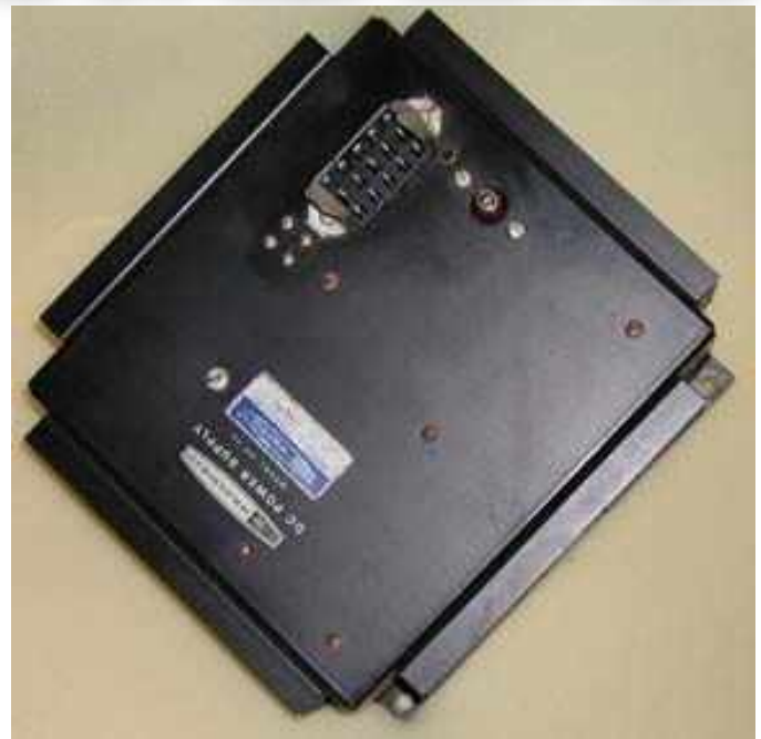
Figure 7: The HP-14 DC Switching Supply

The manual for the HA-14 mentions CW operation in two paragraphs that total barely 2-inch columns in length; no ratings are given on the manual's specification page. The first short paragraph sets the duty cycle limit to 33% and recommends that the HA-14 only be used with the HA-24 AC power supply for CW operation.