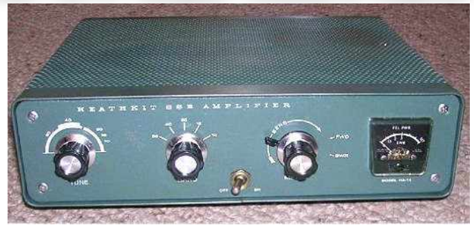
Figure 1: HA-14 "Kompact Kilowatt" HF Linear Amplifier

In order to make an amplifier this small the power supply is external. Heathkit manufactured two power supplies especially for the HA-