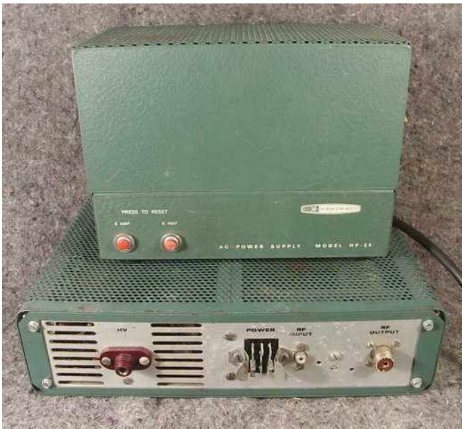
Figure 4: Rear view of the HA-14 With HP-24 AC Supply on top.

While the HA-14 uses an ALC voltage of about 6 volts, the SB-200 threshold voltage is set at 10 volts. The reason, I surmise, is because the SB-200 is rated for a slightly higher output than the HA-14 due in part to the HA-14's lack of forced air cooling (1,200 watts vs. 1,000