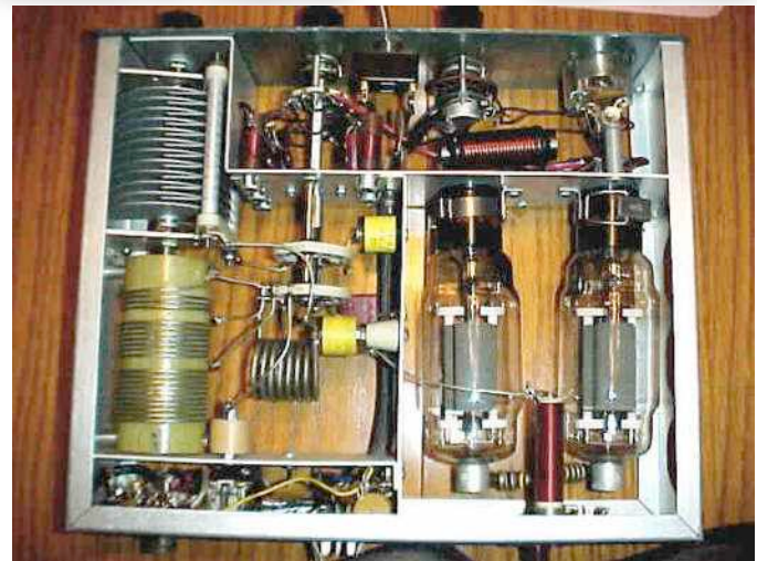
Figure 3: HA-14 Sans Cover

The high voltage to run the finals comes in through a separate Millen high-voltage connector. The voltage is marked as 2,400 volts, but probably sags a bit under load. With each tube drawing somewhat under 250 ma a DC input of 1 KW peak DC input power is easily achieved.