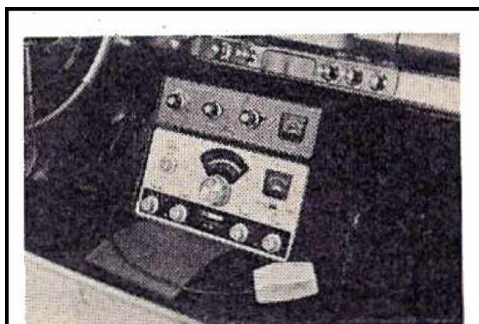
A kilowatt in a car? The "KW Kompact" leaves room to spare.

Mohawk with silver/chrome knobs and light green, dark green paint. After the HA-14, Heathkit produced a line of VHF amplifiers, and a discone antenna that carry the HA designation.