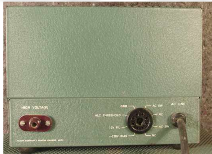
Figure 6: HP-24 AC Power Supply

I briefly covered the HP-14 in HOM #40, but failed to mention the HP-24 when I covered the HP-23 (HOM #26). The HP-24 was built specifically to power the HA-14. Its measurements are identical to the HP/PS-23(-) series that powers so many Heathkit tube transceivers from the HW-12 to the SB-102. About the only distinguishing feature that sets the HP-24 (Figures 4 & 6) apart is the red Millen high voltage connector. The power supply specifications are given in Table IV.