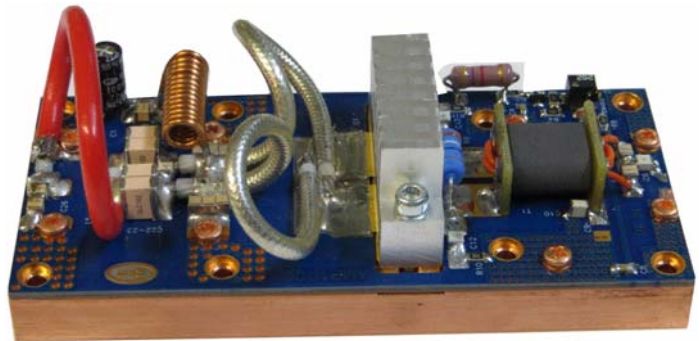
Dimension : 110 X 50 X 30 mm Weight : \leq 0.4Kg