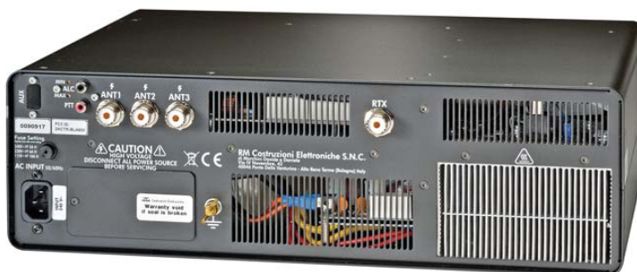
Rear panel of the BLA600, showing available connections. See text for details.

for owners to update firmware in the field, nor is there a USB or serial jack on the rear panel.)