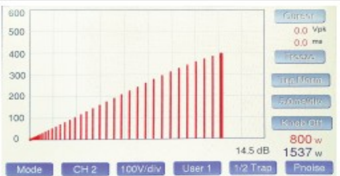
Trapezoid on 6 m.