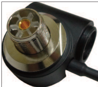
This is a mount with a UHF Female (SO-239) connector