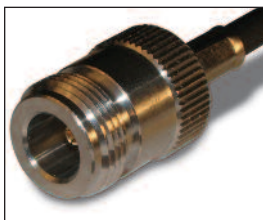
Mobile antenna with Type N Male mates with a mount with Type N Female