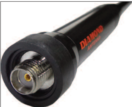
SMA Female (Left), mates with radios, or cables with SMA Male (right)