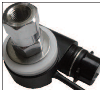
This Mount has a 3/8x24 nut on it, fits heavier screwdriver and most CB antennas.