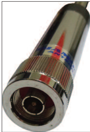
This is a mobile antenna with a Type N Male as its connector