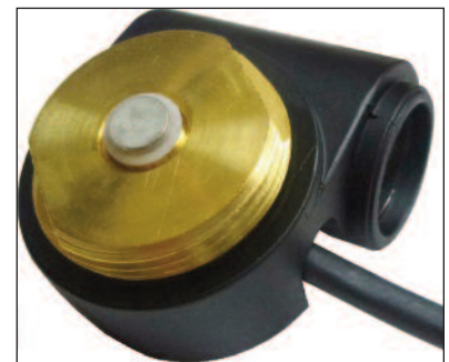
This is a mount with a NMO connector on it.