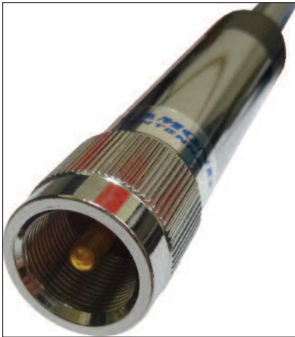
This is the male version of the UHF Connector Also Knows as the PL-259 Mates with Female UHF (SO-239) mount (shown below)