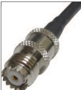
Mini-UHF Female (Left), mates with Mini-UHF Male (right). This connector is used on many different cables Diamond Antenna sells