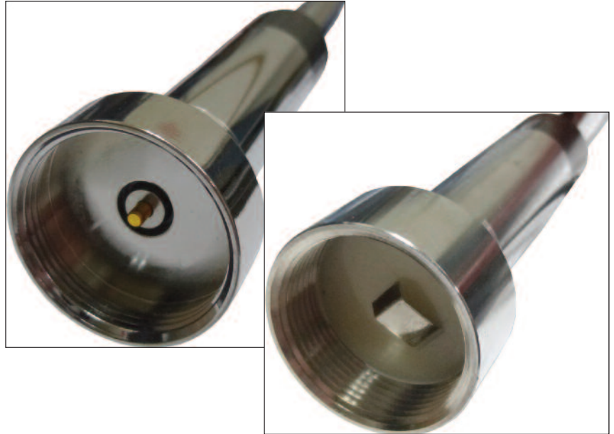
These two are NMO connectors, They are the same connector just built a little different.