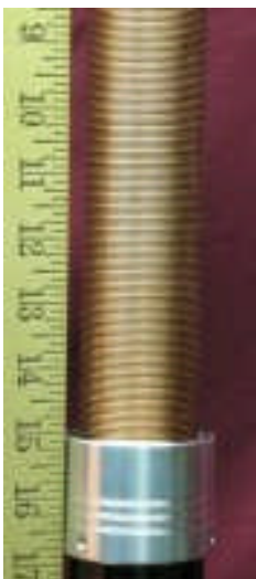
Model 300A -- 1.9 MHz with 5 ft. whip and 15" of coil showing