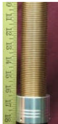
Model 300A -- 1.8 MHz with 5 ft. whip and 16 1/2" of coil showing