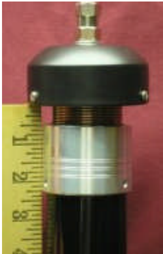
Model 300A -- 14.2 MHz with 5 ft. whip and 1/2" of coil showing