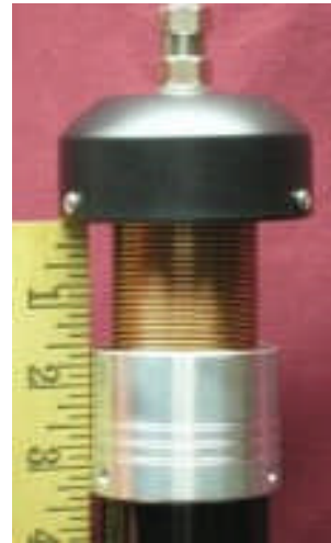
Model 300A -- 7.1 MHz with 5 ft. whip and 1 1/2" of coil showing