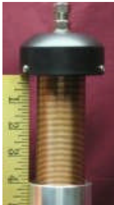
Model 300A -- 3.9 MHz with 5 ft. whip and 4" of coil showing