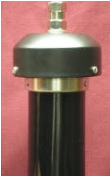
Model 300A -- full down position with 5 ft. whip -- 28.0 MHz