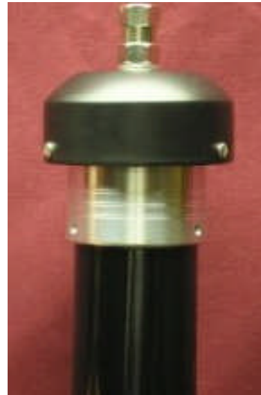
Model 300A -- 21.2 MHz with 5 ft. whip