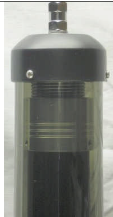
Model 40A-HP -- 21.0 MHz with 5 ft. whip @ 1/2" of coil showing