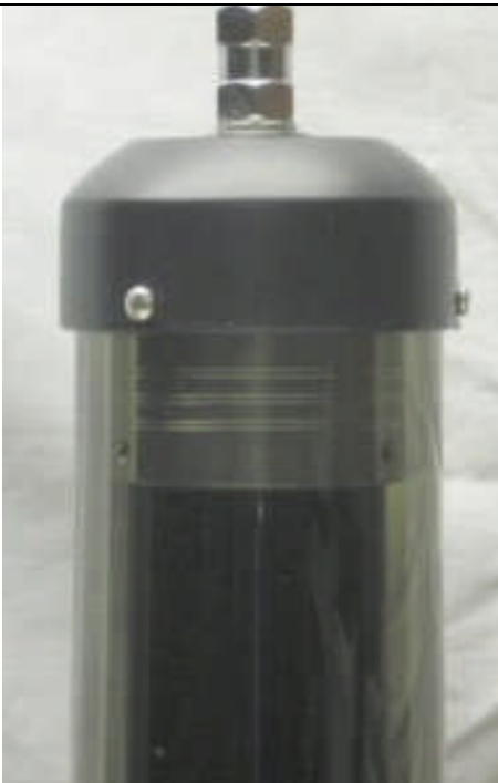
Model 40A-HP -- full down position with 5 ft. whip -- 30.0 MHz

The following photos will show you relative tuning positions of the Model 40A-HP Tarheel Antenna.