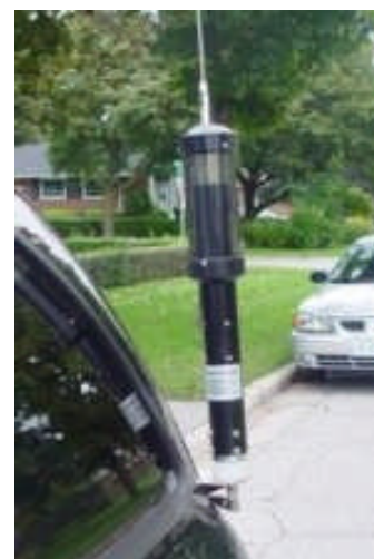
Picture 5 -- SS Flat Plate