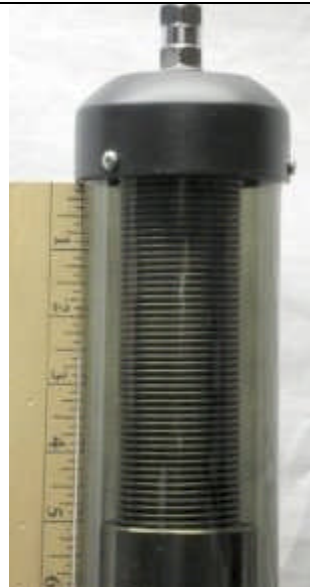
Model 40A-HP -- 7.1 MHz with 5 ft. whip @ 5" of coil showing