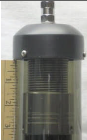
Model 40A-HP -- 14.2 MHz with 5 ft. whip @ 1/2" of coil showing