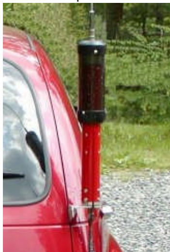
Picture 3 -- SS Door Jam Mount