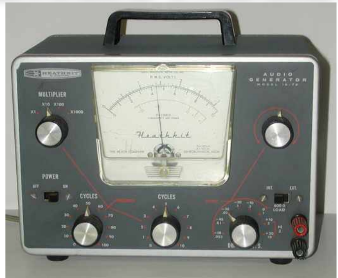
Figure 1: Heathkit IG-72 Audio Generator

In the Heathkits for 1956 catalog the AG-9 was listed as NEW. Prior to that time Heathkit had produced several audio oscillators, some with