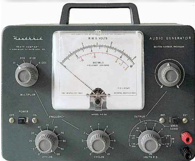
Figure 2: Heathkit AG-9A Audio Generator