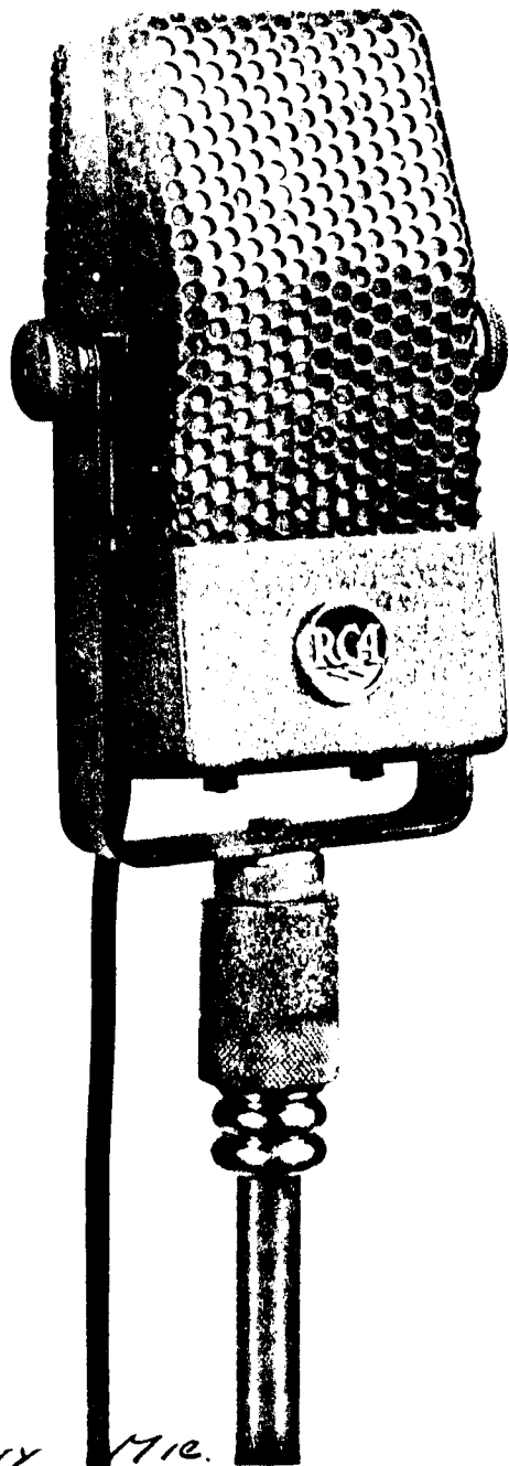
TYPE 74-A VELOCITY MIC.