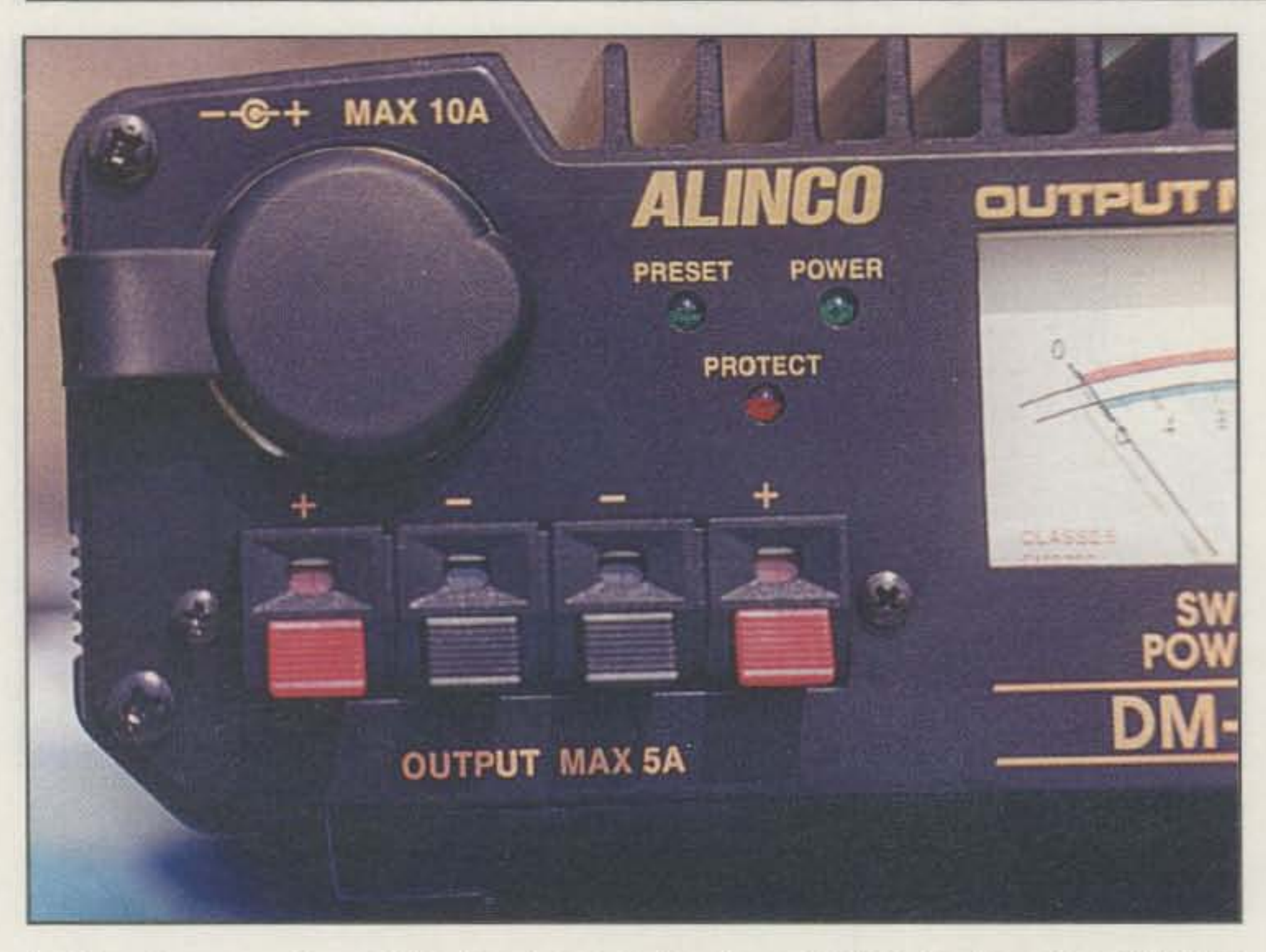
In this close-up view of the front panel, the three LED indicators for PRESET, POWER, and PROTECT can be seen to the left of the meter. The cover on the left is over the cigarette-lighter-type jack input (10 amp max), and the inputs on the bottom are set at 5 amps max.

This allows you to connect a remotecontrol unit (with the power supply turned off) and remotely control the output voltage.