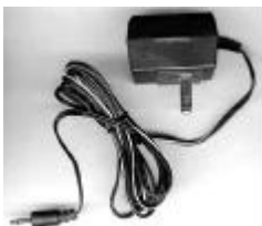
The 120 vac / 12 vdc power supply plugs into the 2.5 mm jack located on the front panel.

Static discharge protection is provided at the (ANT) input for moderate discharges (short of direct lightning strikes).