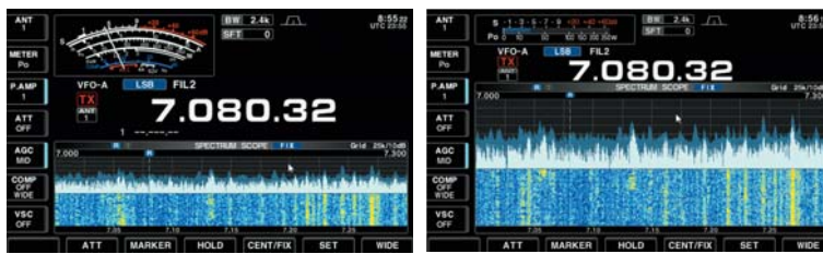
Spectrum scope with waterfall

The spectrum waterfall function can show the changing amplitude of frequency spectrum over time. A weak signal which cannot be recognized with the spectrum scope may be found in the waterfall screen. With the high performance receiver, the IC-7700 increases your chances of making QSOs. When used in combination with spectrum and waterfall screens, you can observe detailed band activity by other stations.