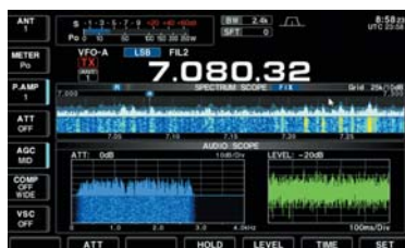
Mini spectrum scope and audio scope