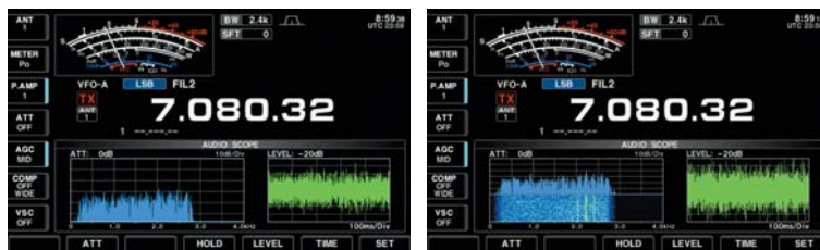
Audio scope (FFT scope and oscilloscope)

* Transmitting audio can be shown on voice modulation modes only. The transmit quality monitor function must be ON to monitor the transmitting audio.