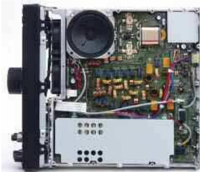
PHOTO 2: Top view with covers removed showing PA, output filters and auto ATU.