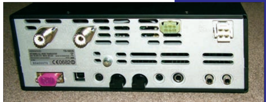
The rear panel of the transceiver showing the h.f. and 50MHz antenna inputs.

It's also possible to select a Continuous Tone Controlled Squelch