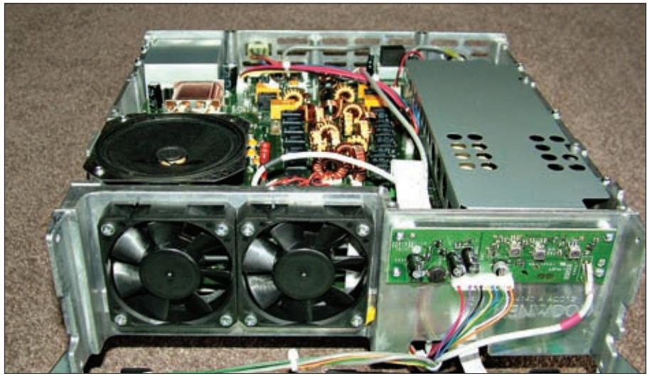
A pair of slow running 60mm square fans assist the cooling on the TS-590S.

Two noise blankers, or 'reduction functions' in modern parlance, are used to reduce interference and a nearby electric fence was certainly quietened down by these. Electric fence are one of