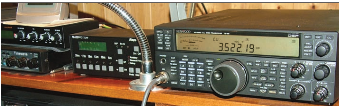
The TS-590's high contrast main display.

I also worked a number of USA and Canadian stations, one in ZF1, Grand Cayman Island, ZL50VK in New Zealand and an OY and a UA9 on 1.8MHz. The Top Band QSOs were on c.w. using a 1.8MHz inverted V dipole with the apex at 90ft on my tower.