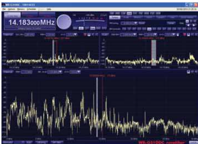
PHOTO 3: The control panel continuously displays three spectrum scans.

on the filter length and are given in Table 2 for the default setting of 200 and maximum length 5000 with the 2.4kHz bandwidth filter.