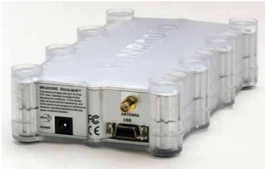
PHOTO 1: The Excalibur receiver hardware is contained in a small shielded box inside a clear plastic case.

A direct digital sampling receiver for use up to 50MHz