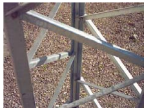
Triangular bolted section SR5

Our tower-structures are wholly of steel, modular and hot-galvanized. Bolted construction is used throughout the tower for a couple of good reasons. Mainly this gives the owner the choice of having the tower shipped unassembled (knocked-down) in kit form, and also offers the ability to replace tower components in the field with just a wrench, should a structural member ever become damaged. Shipping in kit form can also save a bit on freight costs to the delivery point. Tower sections are connected together with 24 bolts per connection, using steel splice plates on both the outside and inside of each leg intersection, forming an extremely strong and positive joint. Some radio-antennas, fixed or rotative, can be placed at the structure top by special supports. In case of rotative antennas, special supports can be inserted in the inside of the last module to fasten rotators of our production and all the others present on the market. Furthermore the mast can be locked by a thrust-holder bearing support and guided by supports having nylon bushings.