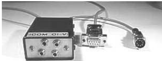
External view of homebrew interface with 4 connectors to rigs.

This design is in use with all my ICOM rigs since many years, without any problems. The power comes directly from the ICOM rig, one of the AUX connectors on the rear. Since this connector provides SQL (open, closed) information as well, i have fed this line through the MAX232 to the RS232 CTS signal and can use it in my software.