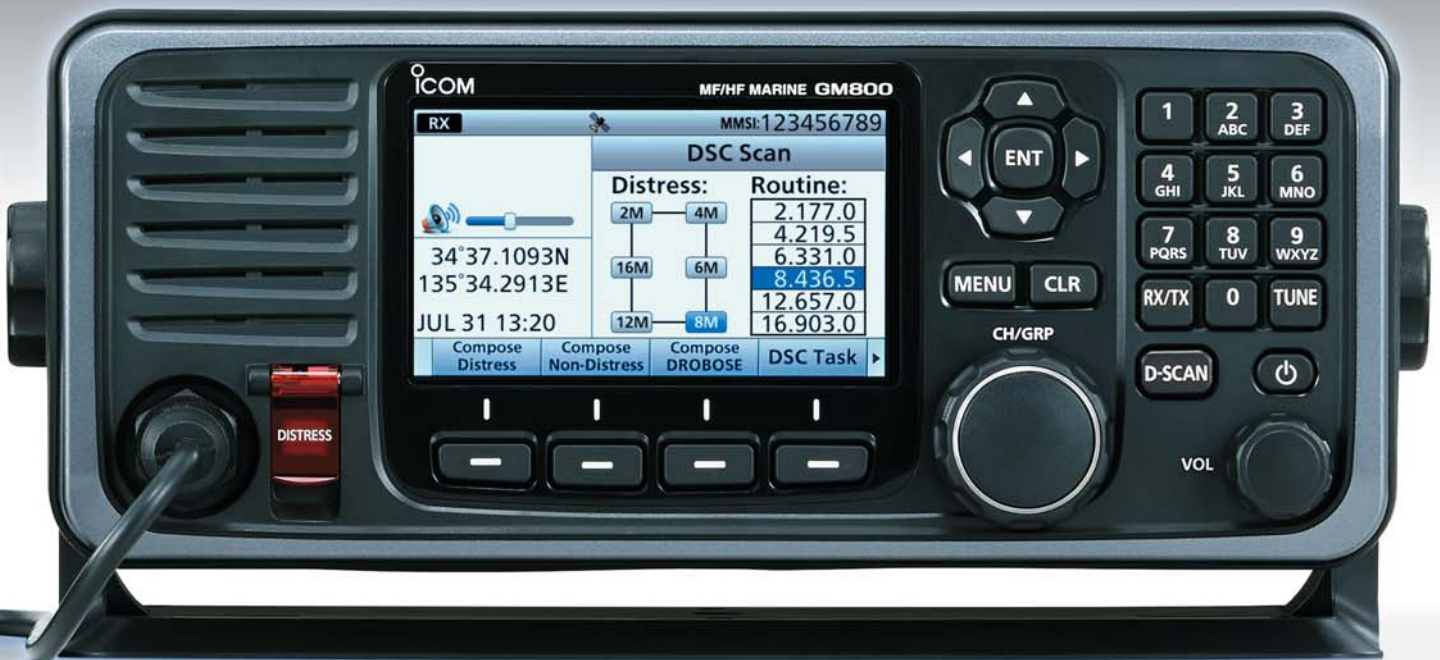
Day mode display (DSC scan screen)