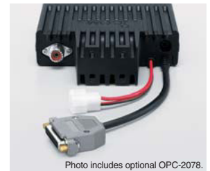
Photo includes optional OPC-2078.

The optional ACC cable allows you to connect with various external devices to control audio output, modulated signal input, remote channel control, horn honk and many more functions. OPC-1939 is a D-SUB 15-pin type and OPC-2078 is a D-SUB 25-pin type.