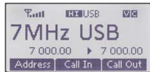
Function button menus are shown at the bottom of the display

The following functions can be assigned to the [I], [II], and [III] function buttons: Main menu, Manager menu, Set mode, Selcall address list, RX history, and TX history.