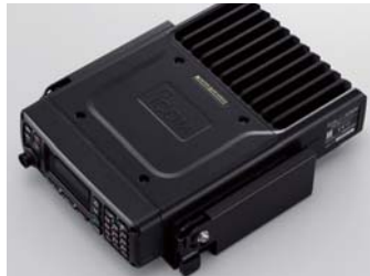
IC-F8101 with optional MB-126.

The IC-F8101 has a durable, enclosed structure securely sealed from intrusion by all potential elements, and is a visibly compact package. The IC-F8101 and the CFU-F8100 cooling fan unit has