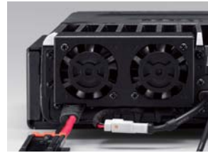
Optional CFU-F8100 fitted to the rear panel.