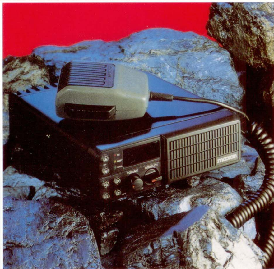
VHF synthesised mobile radio