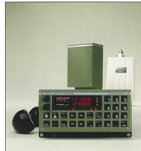
"SAILOR" COMPACT HF SSB RADIOTELEPHONE

AC: type N2161, 110/127/220/240V AC. 50-60 Hz to 29V DC. Max. output current 20 Amps. Automatic change-over between AC and DC. May also supply 12V DC power for e.g. the VHF.