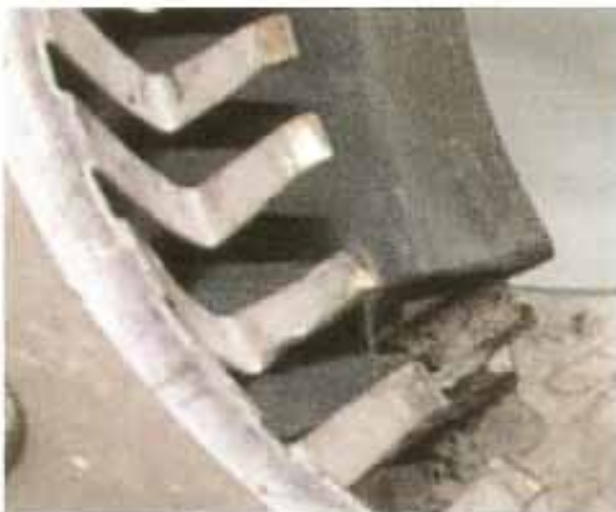
Figure 7. Bent and broken finger stock. Finger stock may become damaged due to effects of overheating or mishandling. Any broken finger stock must be repaired or replaced immediately to ensure long tube life.

The key to extending the life of a thoriated tungsten filament emitter is to control operating temperature. Emitter temperature is a function of the total RMS power applied to the filament. Thus, filament voltage control is temperature control, because temperature varies directly with voltage. Figure 8 shows that useful tube life can vary significantly with only a 5% change in filament voltage.