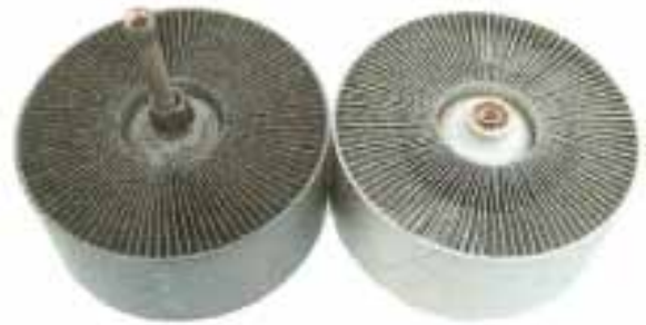
Figure 2 . Improper cooling means short life. Discoloration of metal around the anode fins (left) indicates poor cooling or improper operation of the tube. A properly cooled and operated tube (right) shows no discoloration after many hours of use. Note: these pictured anodes were part of a collection being prepared for remanufacture.

The useful operating life of a thoriated tungsten emitter can vary widely with filament voltage. Figure 8 describes the relative life expectancy with various filament voltage levels. Obviously, a well-managed filament voltage program will result in longer life expectancy. Improper management, on the other hand, can be very costly.