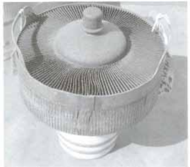
Figure 3. Example of a severely overheated tube. The cooling fins are discolored and badly distorted. This type of overheating will cause premature tube failure.