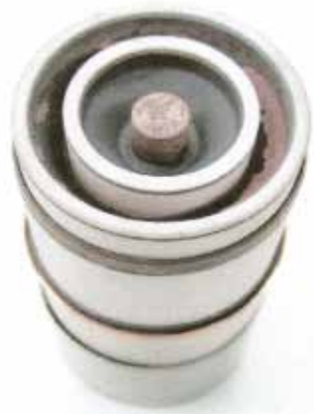
Figure 4. Tube with evidence of overheating. Note the severe discoloration in the tube stem. This tube will have a very short lifetime.