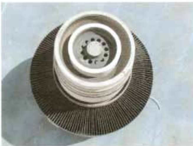
Figure 6. This tube appears to have been in a socket for only a short time, but already has evidence of overheating. Note the discolored stem and anode fins. This tube will have a short lifetime.