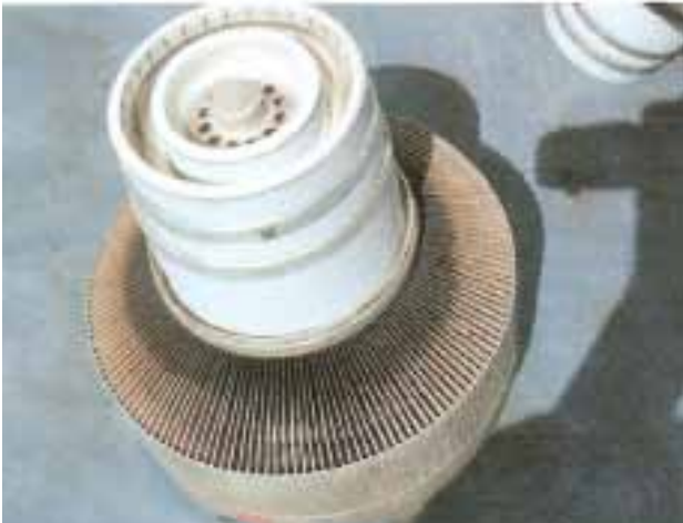
Figure 5. This tube shows evidence of being well mounted in a socket for at least a year (note the marks on the contact ring from the finger stock). However, there is no discoloration of the stem and the anode fins have very little discoloration. This tube will last for a good period of time because it is being run under favorable conditions.