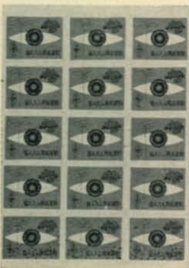
A sheet of JBHC seals.

I N Japan today there are more than 200,000 blind people. Out of consideration for these people, the Japanese Amateur Radio League assisted in the formation of the Japanese Blind Hams Club (JBHC) 5 years ago. Through JARL the nucleus of 5 original members has grown to over 300.