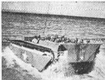
LVT-4 LANDING VEHICLE TRACK*