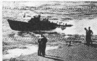
AIRCRAFT RESCUE BOAT*