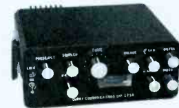
FIGURE 2. The EXP-1750 Transceiver mounted in a prototype enclosure. This cabinet is not included with the transceiver, but is expected to be available as an option in the near future.

Current U.S. and Canadian regulations allow no more than 1 watt of input power and a maximum antenna length of 15 meters (50 feet) for operation on the 160-190 kHz band. Since the EXP-1750 is capable of up to 20 watts output, users must ensure that the RF power is set within legal limits. (If an LF ham band becomes a reality in the USA, the transceiver's higher power capability could prove very useful.)