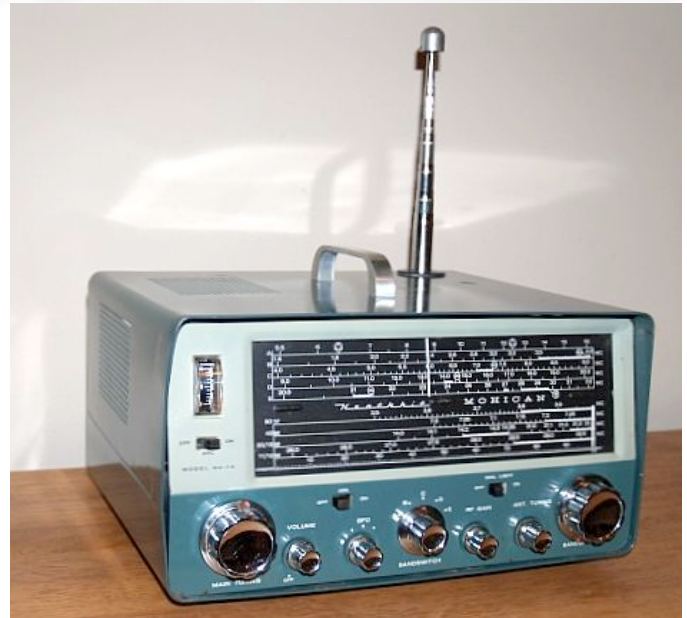
Fig 1: Beautifully Restored GC-1A Mohican.

I could not find a copy of the manual or even a schematic of the early GC-1. I did find a schematic of the GC-1U which is the European version of the GC-1.