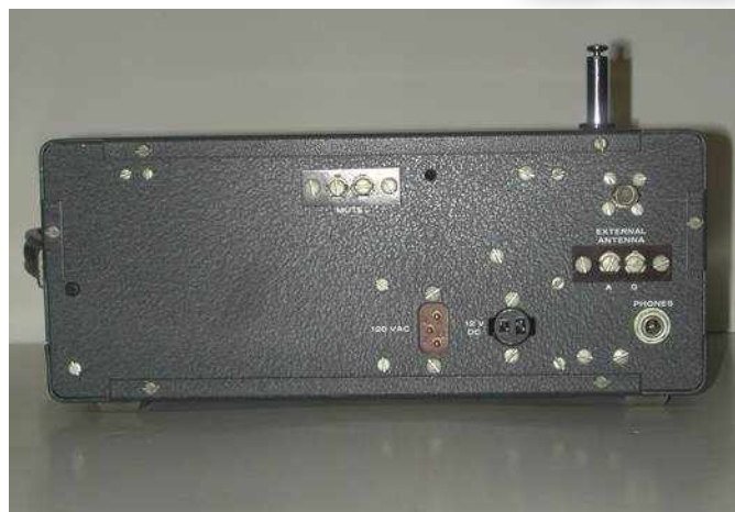
Figure 2: Rear view of the GR-78 showing the five connectors. A sixth connector has been added (neatly) to this radio. It is the BNC jack in the upper right.

this could be a fire hazard. A fuse, placed in the battery line might make a good modification.