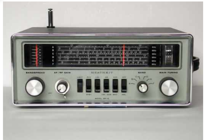
Figure 1: Heathkit GR-78 Portable SW Receiver

The GR-78 communications receiver, shown in Figure 1, comes in a reasonably small package for its day. It weighs 10 lbs. and measures just