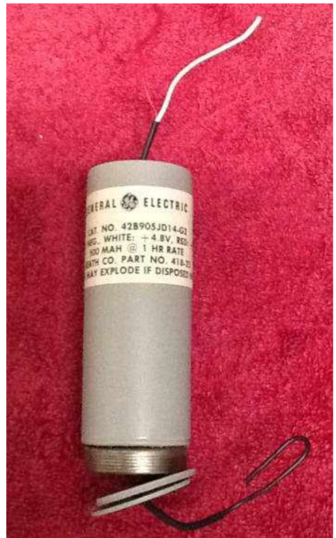
Figure 3: NiCad battery from Heathkit GR-78 radio. The forty-year-old battery actually charged up on the bench but quickly swelled after a few charge cycles pushing out the bottom of the case and failing internally.

Two separate band-spread dial labels are supplied for the band-spread drum. One if your