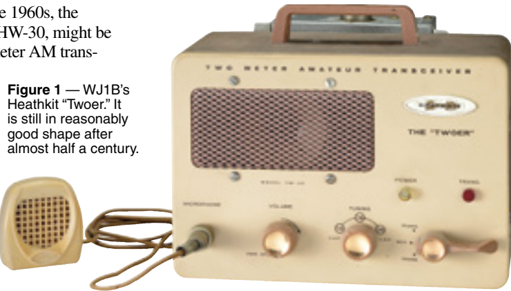
Figure 1 — WJ1B’s Heathkit “Twoer.” It is still in reasonably good shape after almost half a century.

The Twoer was nicknamed the “Benton Harbor Lunchbox” because Heath Company was located in Benton Harbor, Michigan and it actually looked like a lunchbox with its metallic beige case, boxy shape and its handle on the top (see Figure 1). There was even a handy slot on the side of the case to hold a copy of your license. The front panel had only three controls: On/Off/Volume ; Tuning ; and Transmit/Receive — with both PTT and lock positions on transmit. It