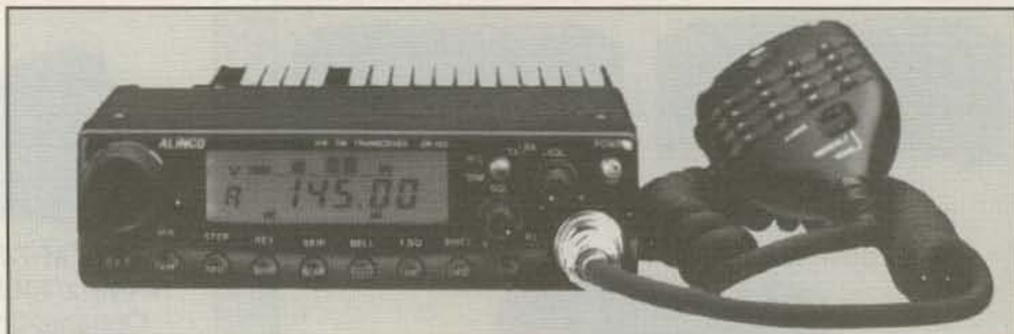
The Alinco DR-150T TNC.

As a matter of interest, I've found that the DR-150T performs as well in 9600 baud packet operation as it does with voice applications. To give you a better understanding of what you