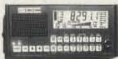
SG-2000 standard SSB head - a world proven HF transceiver.