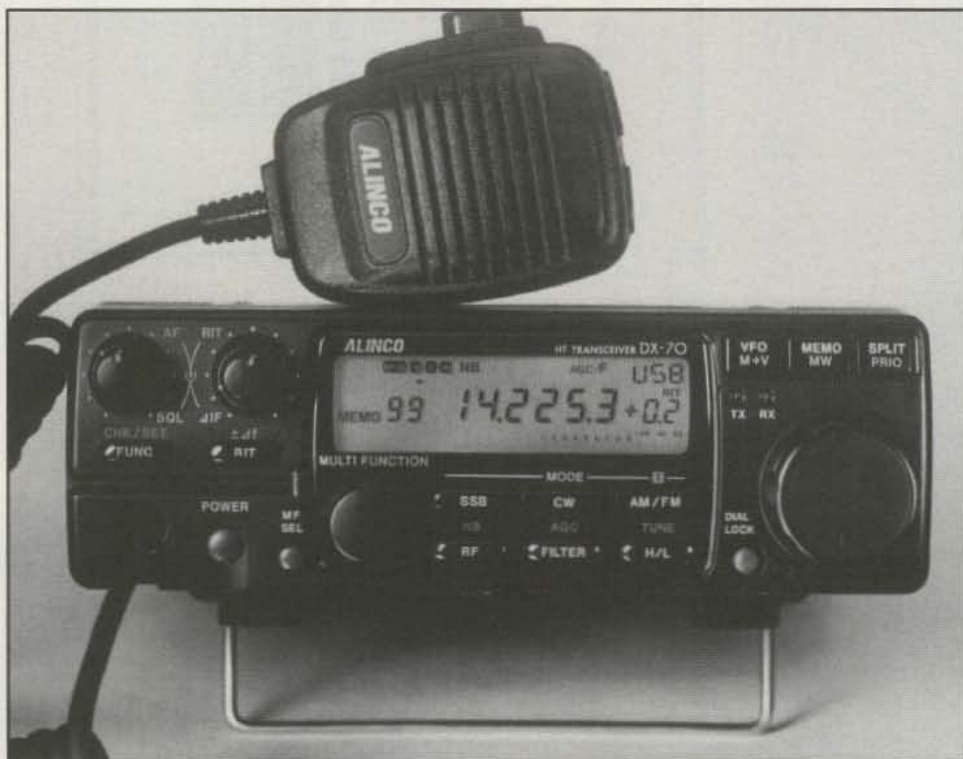
The Alinco DX-70TH HF/VHF transceiver.

As time passed, a new firm called The Heath Company came into the amateur manufacturing marketplace. I had a Sky-Buddy receiver that did well. The Heath Company introduced a transmitter kit called the AT-1. I gazed at the AT-1 photo