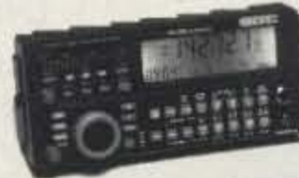
SG-2000 PowerTalk with DSP Rated "Best Buy" in Practical Sailor