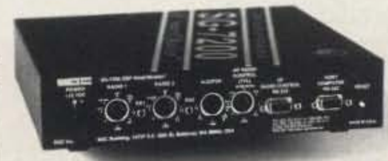
standard ports on back of SG-7200

Mate the SG-7200 with SGC's popular SG-2000 or SG-2000 PowerTalk HF radios for advanced data and voice technology. Competitive package pricing of the SG-7200 and SG-2000 series of transceivers make this your best choice for data/voice link to the world.