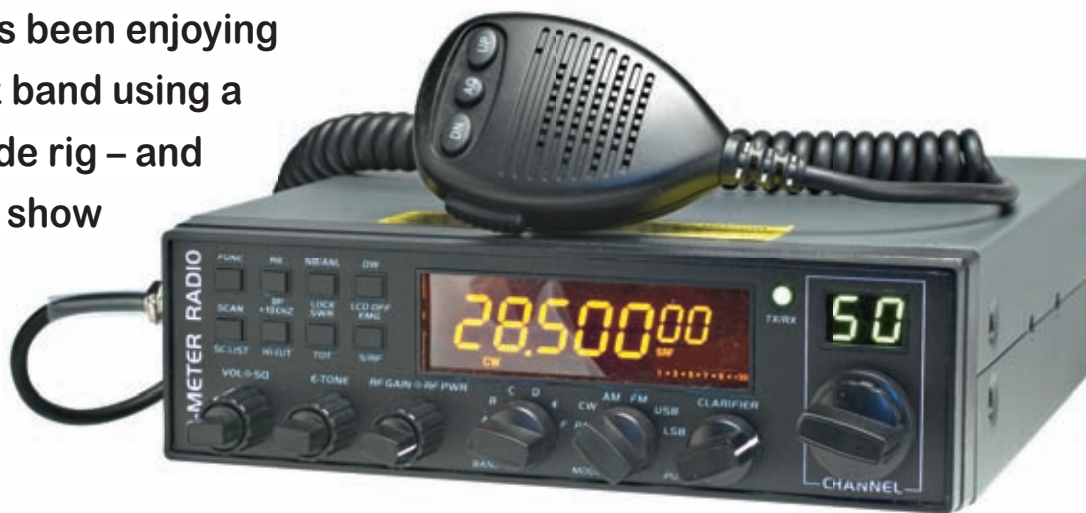
Fig. 1: The transceiver is smart looking and although it is clearly a CB radio design there are many controls on the front panel that will be familiar to most of us.

To be quite frank, the DX I worked during the wonderfully persistent conditions on 28MHz in the latter half of 1968 has never re-appeared for me! In one afternoon I worked all continents using a.m. and my