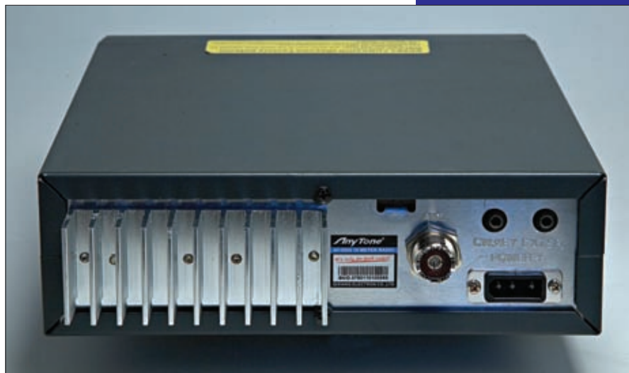
Fig. 2: The rather spartan back panel, has little more than a d.c. power socket, an SO-239 antenna socket and two 3.5mm jack sockets, one for the external speaker and the other for a Morse key.

Nevada Radio Unit 1 Fitzherbert Spur Farlington Portsmouth Hampshire PO6 1TT Tel: (023) 92 31 3090 FAX: (023) 92 313091 E-mail: sales@nevada.co.uk Website: www.nevadaradio.co.uk/