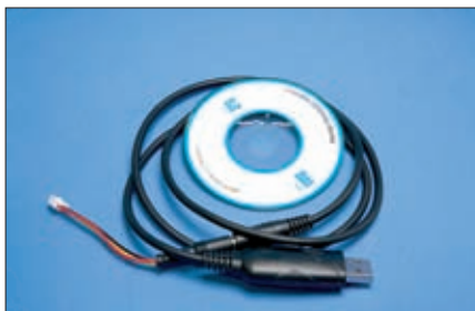
Fig. 4: The programming interface and software CDROM. Unusually you have to remove the covers, to fit the interface into a small p.c.b. mounted socket just visible to the right of the upper flat ribbon cable in Fig. 3.

f.m. – so it's a good idea to monitor both channels.