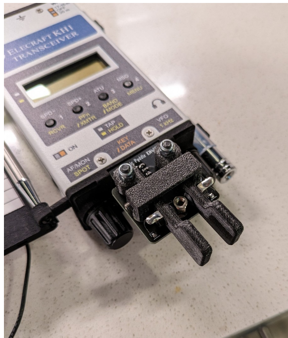
Elecraft KH1 Iambic Paddle