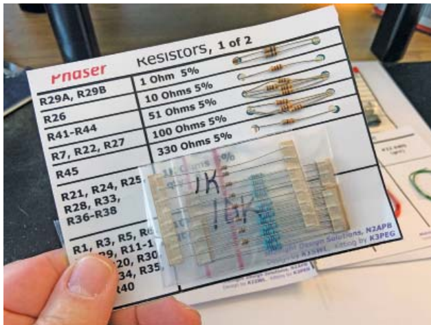
Figure 4 — Parts are mounted on labeled cards for easy identification.

The Phaser transceiver generates about 4 W SSB output. Because virtually all FT8 operating takes place using upper sideband (USB) transmissions, the Phaser is hardwired for that mode.