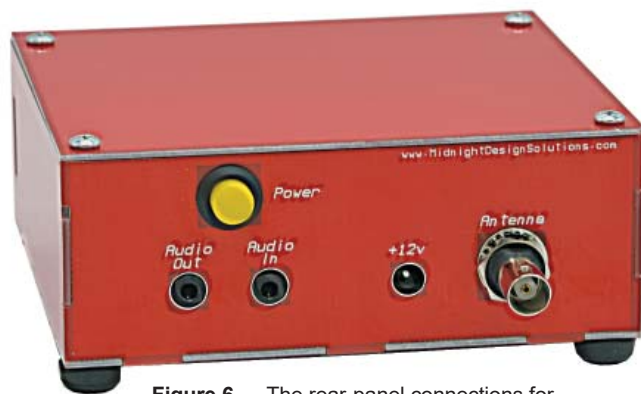
Figure 6 — The rear-panel connections for AUDIO IN/OUT, ANTENNA, and POWER.