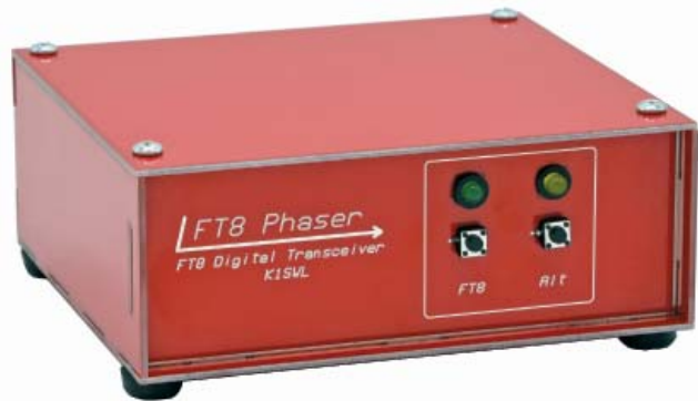
Figure 5 — The Phaser enclosure front panel includes switches and LED indicators for selecting the standard FT8 frequency or alternate (user-programmed) frequency. (Note that the TRANSMIT indicator LED incorporated into the latest version could be mounted on the front panel as well.)

The assembly steps are divided into six groups of parts. When you complete a group, the manual instructs you to run some tests to make sure that the section of the transceiver you just built is functioning normally. I'm an experienced kit builder, so I chose to skip the tests. That's not the best approach for these