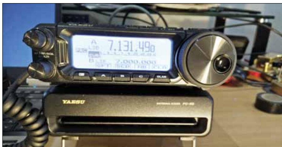
Fig. 2: The FC-50 ATU, below the FT-891 (But not attached with the Yaesu brackets).

(as against computer-sent). I used semi-break-in (there is no full QSK facility with the 891), and the keying seemed to be clean when monitored on another receiver. The FT-891's own receiver coped well with the band activity – I used the filtering in the narrow setting. I was aware of stations outside the immediate passband, which doesn't happen with my Elecraft K3 but that costs probably four times as much and is fitted with mechanical filters that supplement the DSP (digital signal processing). However, unlike with some receivers I have used previously, I didn't lose any contacts as a result of off-channel interference. In the SSB leg I received some unsolicited comments about the excellent audio from strong local stations who know my voice (I was using the supplied microphone and hadn't made any adjustments to the equalisation) and found the receiver to be excellent, even when pulling out very weak calling stations.