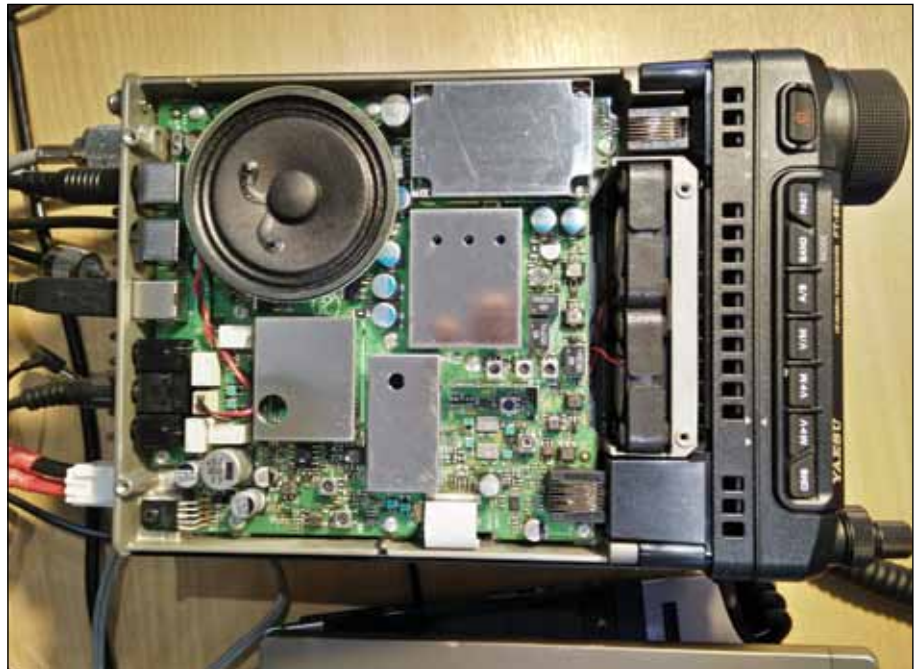
Under the cover. The small speaker is more than adequate for communications purposes.

In practice, I found the tuner straightforward to install and use and it does what it says on the can. What I did find awkward was using the various buttons on the FT-891 when it was sat on