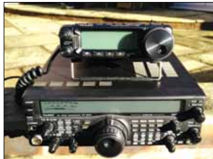
A size comparison with the author's FT-847, a typical base station transceiver.

the tuner so, in practice, if I was using this setup regularly at home, I think I would 'lose' the tuner off to one side rather than physically attach it to the FT-891.