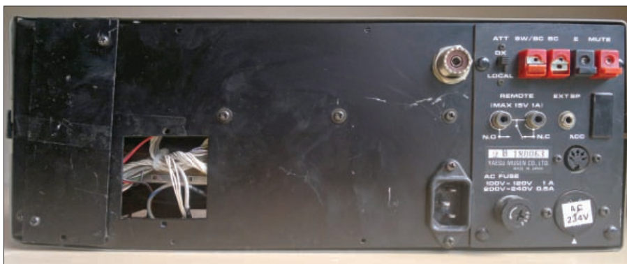
The classic 'rear view'. Simplicity in the extreme!

Model 'A' covers 118-130, 130-140 and 140-150MHz, Model 'B' covers