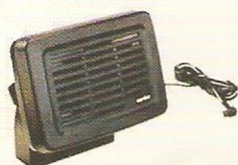
MLS-100 High-Power External Speaker