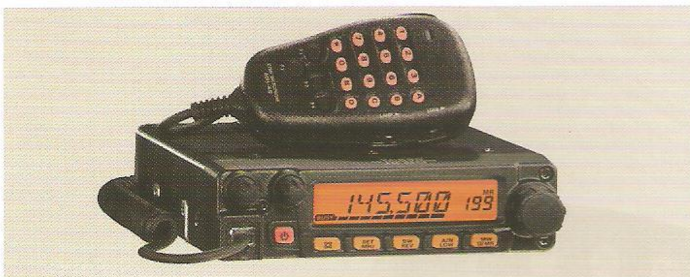
Specifications and subject to change without notice or obligation.