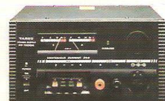
FP-1030A AC Power Supply (25 A)