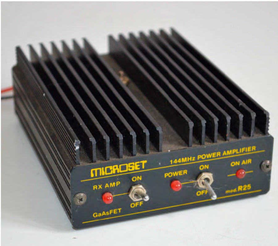
Fig. 3: The Microset 2m 30W in-line linear amplifier and receive preamplifier.