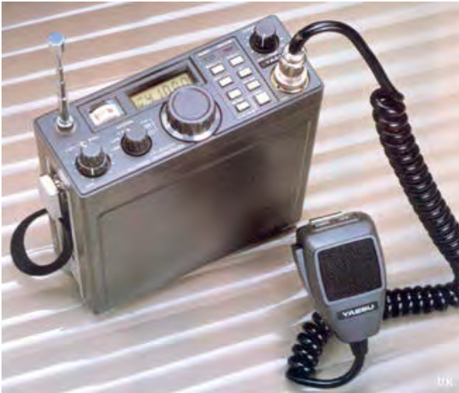
Fig. 1: The Yaesu FT-290 Mk1.

This month Chris Lorek G4HCL revisits the hugely popular Yaesu FT-290R Mk1 2m multimode transceiver.