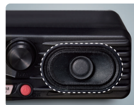
3 Watt (35 x 58mm) Front Speaker

The front facing speaker provides 3 watts of loud audio, The FTM-3200DR/DE, FTM-3100R/E speaker audio has been tuned for even better sound quality. An optional MLS-100 external speaker supports noisy field operation.