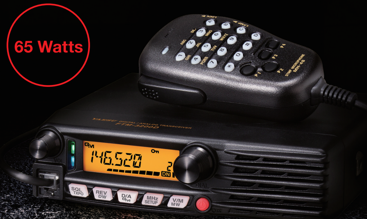
Photo shows the FTM-3200DR/FTM-3200DE