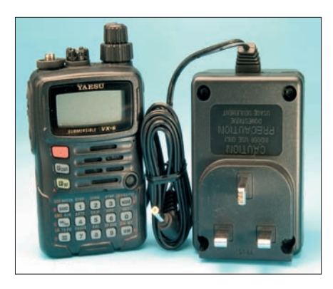
Fig. 3: The rig has two main control knobs on the top of the unit - also showing the charging unit for size comparison - and these are ordinarily used to control the tuning and volume.

The l.e.d.s on the front of the rig illuminate in the same way as many others - but with a slight difference. It glows red on transmit and green on