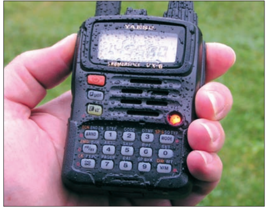
• Fig. 1: The sturdy Yaesu VX-6E shrugs off the rain - unlike GORSN!

Optional accessories can be purchased and these are designed with this specific type of four